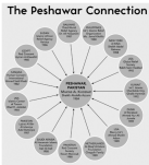
Figure 1 The Peshawar Connection

As his Friday sermons became more strident and implacable in the cause of jihad so too did his enemies in the government of Pakistan and among the rival mujahideen factions. In mid-1989 a bomb planted beneath his pulpit for his Friday sermon in the mosque failed to explode, but on 24 November while he was driving to the mosque with his two sons his car stopped momentarily on the road in time for a planted bomb to destroy the car and its occupants. It is said that Shaykh Abdullah Azzam was found whole but dead with only a trickle of blood befitting the martyrdom he seemed to crave. The charitable said that ISI did him in; the uncharitable that it was the CIA.