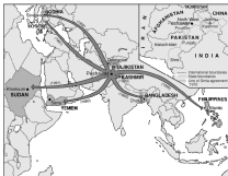
Map 1 The Postwar-Al Qaeda nexus

one. Above all, Salafists insisted that Islam was Arab and its language Arabic. Although traditional Salafists believed that it is not permissible for Muslims to overthrow a Muslim ruler no matter how cruel, incompetent, or secular, contemporary Salafist Islamist jihadists have contemptuously rejected this belief [142]